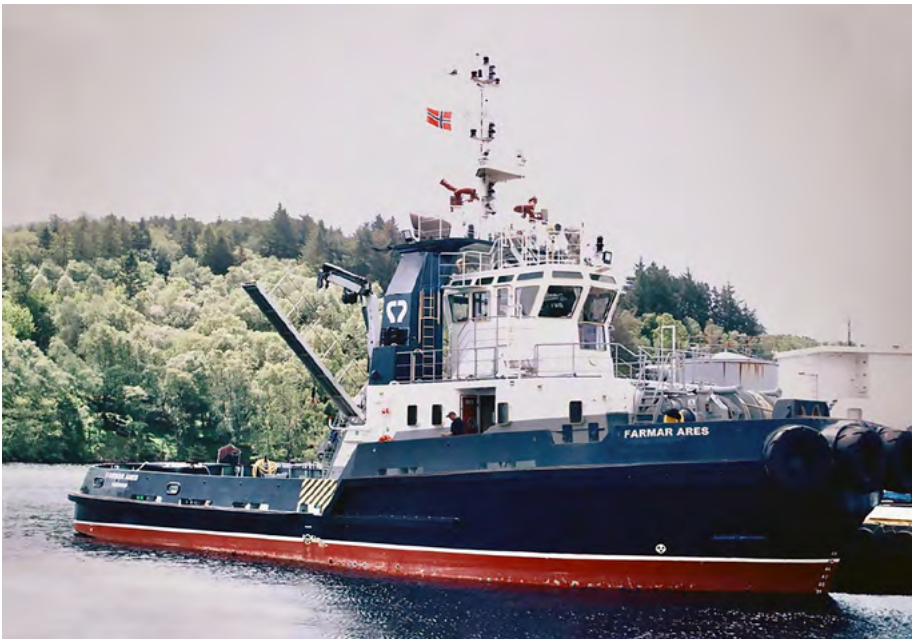
FARMAR ARES Spain