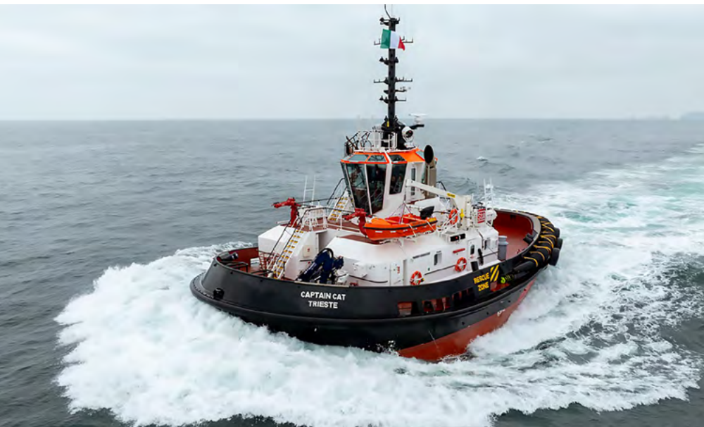
CAPTAIN CAT Italy