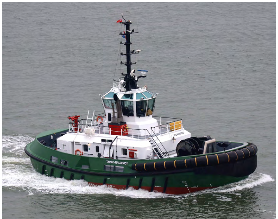
TARGE GUILLEMOT Belgium

C-Fenix (2024 – MMSI 710007289). Yard: Detroit Brasil Shipyard. Dim. 24,35 x 11,00 x 4,60. Output: 5.438 bhp. Bollardpull: 70 tonnes. Owner and operator: Camorim Servicos Maritimos Ltda., Niterói.