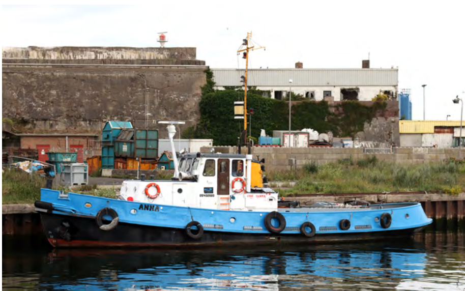
ANNA The Netherlands

OSV Oceanic III (2024 – 9419515) owned and operated by Midnight Sun Transportes has been sold in 2024 to new owner CF Fortune B.V., operated by Chevalier Floatels B.V., Kootwijkerbroek (NLD) and has been