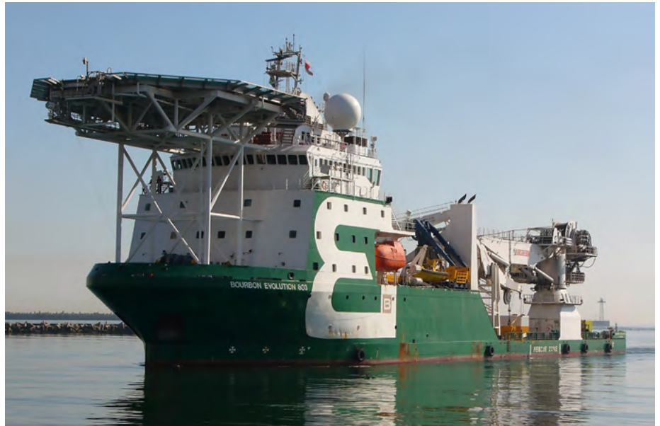
BOURBON EVOLUTION 803 Singapore

Tug Dinamo III (2025 – 1037311). Yard: Sanmar Denizcilik Makina ve Ticaret, Istanbul, ynr. 335. Dim. 25,40 x 12,86 x 5,23 mtr. Engines: 2x Ramme Electric Machines GmbH. Fully electrical. Output: 5.710 bhp. Speed: 11 kn. Owner and operator: builders account. Tug Yenicay XIX (2025 – 1037256). Yard: Sanmar Denizcilik Makina ve Ticaret, ynr. 307. 145 GT. Dim. 18,70 x 9,20 x 3,50 mtr.