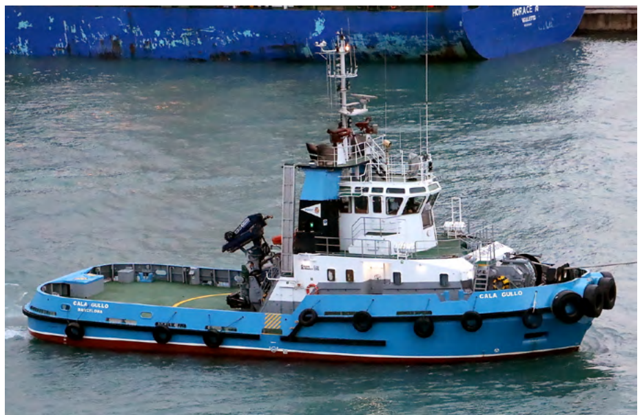
CALA GULLO Spain

Tug Kaku , ex Naupaka '16 (1983 – USCG 661812) owned and operated by Pacmar Technologies LLC has been sold in 2025 to