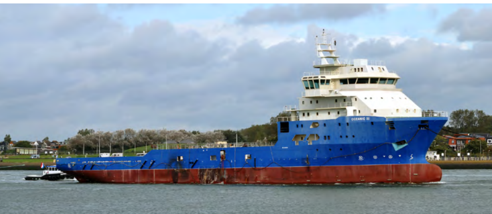
OCEANIC III Portugal

Tug Cala Gullo (2016 - 9791509) owned and operated by Remolcadores Unidos sank on 30 June 2025 during the maneuvering of containership Cape Sounio as it departed the Hutchinson Ports Best terminal in Barcelona. The incident occurred during when the tug was carrying out support tasks for the