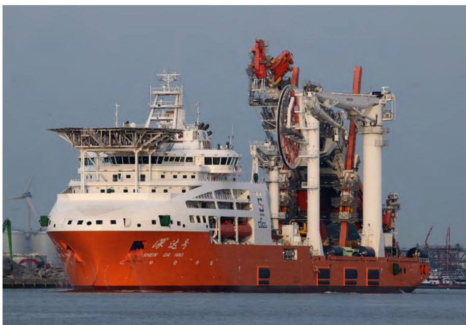
SHEN DA HAO China

Tug Arau (2025 – IMO/MMSI: -). Stan Tug 1606 design. Yard: Damen Shipyards, ynr. 503240. 90 GT. Dim. 16,56 x 5,54 x 2,54 mtr. Engines: 2x Caterpillar. Output: 609 bhp. Bollardpull: 16 bhp, speed: