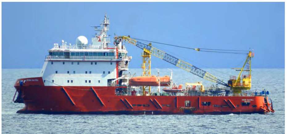
ICON KAYRA Brunei

Tug Ning Gang Dian Tuo 1 (2024 – IMO/MMSI: -). Yard: Jiangsu Zhenjiang Shipyard. 417 GT. Dim. 36,50 x 10,00 x 4,50 mtr. Engines: fully electrical. Output: 4.000 bhp. Bollardpull: 52 tonnes, speed: 13 kn. Owner and operator: Nanjing Port Group. First pure battery powered inland tug in Yangtze River Basin. OSV/Cablelayer Shen Da Hao (2025 – 9870537). Yard: Beihai Shipbuilding, ynr. AH0043AL. 29.272 GT. Dim. 177,10 x 33,00 x 14,40. No further details available. Owner and operator Shanghai Salvage Company, Shanghai.