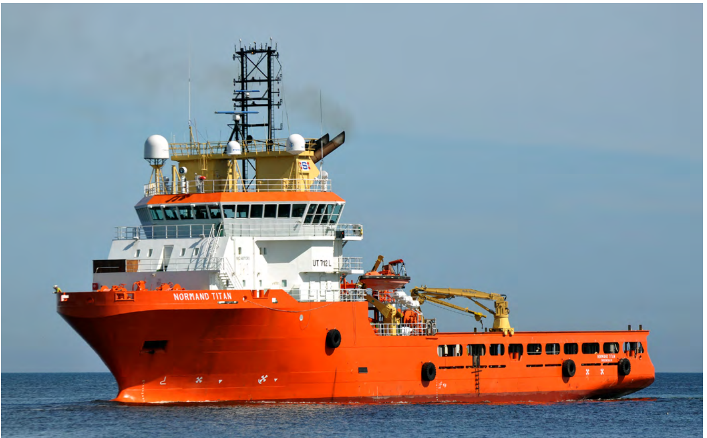
NORMAND TITAN Norway

Tug ASL Pelican , ex Swiber Pelican '10 (2008 – 9502087) owned and operated by Capitol Offshore Pte. Ltd. has been sold in 2024 to new owner and operator Linden Shipping Int'l LLC, Dubai (ARE) and has been renamed Marlin Ann 2 . MPSVs Bourbon Evolution 801 , ex Ungundja '15 (2011 – 9615987) and Bourbon Evolution 803 (2013 – 9639804) both owned by Venus Offshore Pte., Ltd., operated by Bourbon Offshore Asia Pte. Ltd. have been transferred