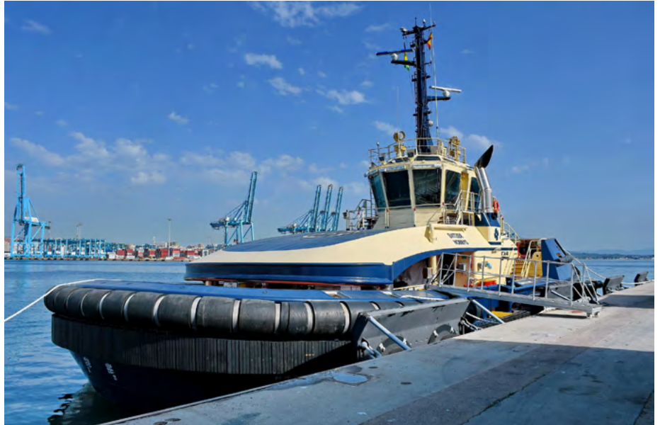
SVITZER NOBBIS Australia

Tug 51 (2021 – 9890127) owned and operated by Port of Antwerp-Bruges has been sold in 2025 to new owner and operator Targe Towing Ltd., Dundee (GBR) and has been renamed Targe Guillemot . Tug 52 (2021 – 9890135) owned and operated by Port of Antwerp-Bruges has been sold in 2025 to new owner and operator Somara, Fort de France (MTQ) and has been renamed Ziguidi .