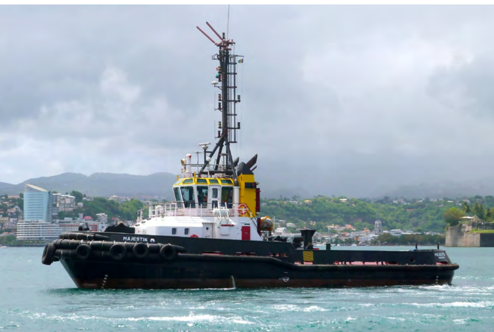
MAJESTIK Trinidad & Tobago

Towboat Midwest Challenger (2023 – USCG 1332445). Yard: Nichols Boat Company Inc.,