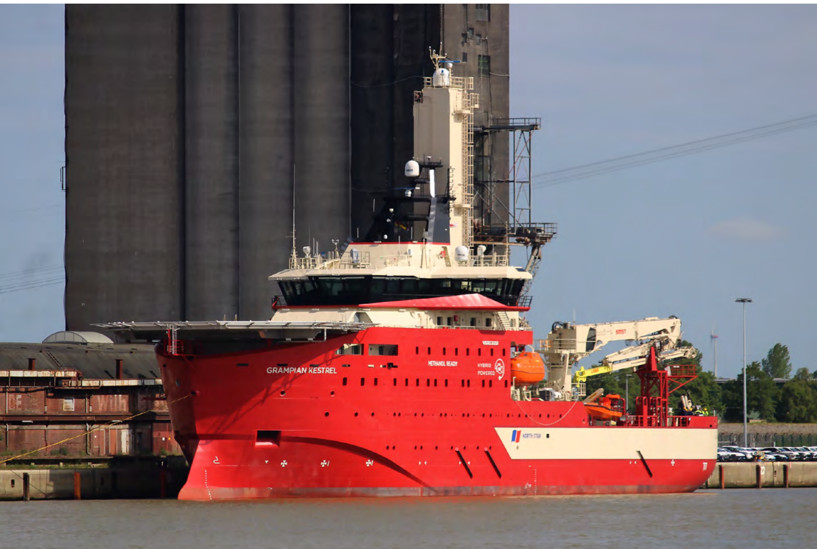
GRAMPIAN KESTREL United Kingdom

The editors regrets that the e-magazine is unable to supply photographs published in Worldwide Tug & OSV News.