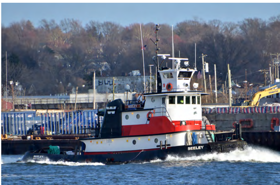
SEELEY United States