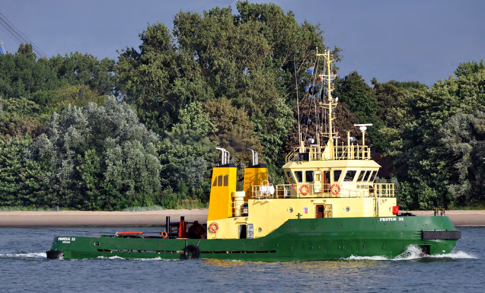
PROTUG 33 The Netherlands