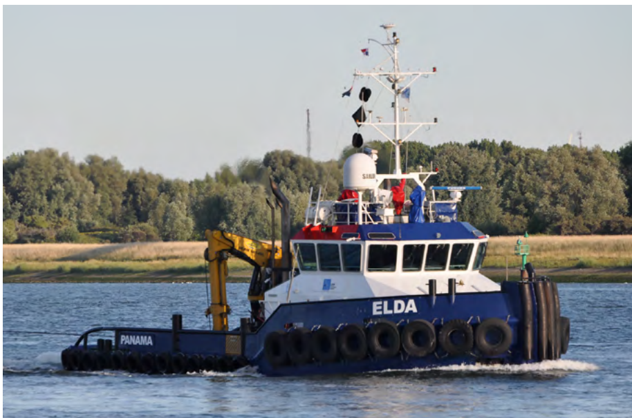
ELDA United Kingdom

Worldwide Tug & OSV News can also be found on www.tugezine.com , www.towingline.com – Archive and www.sleepduwvaart.nl