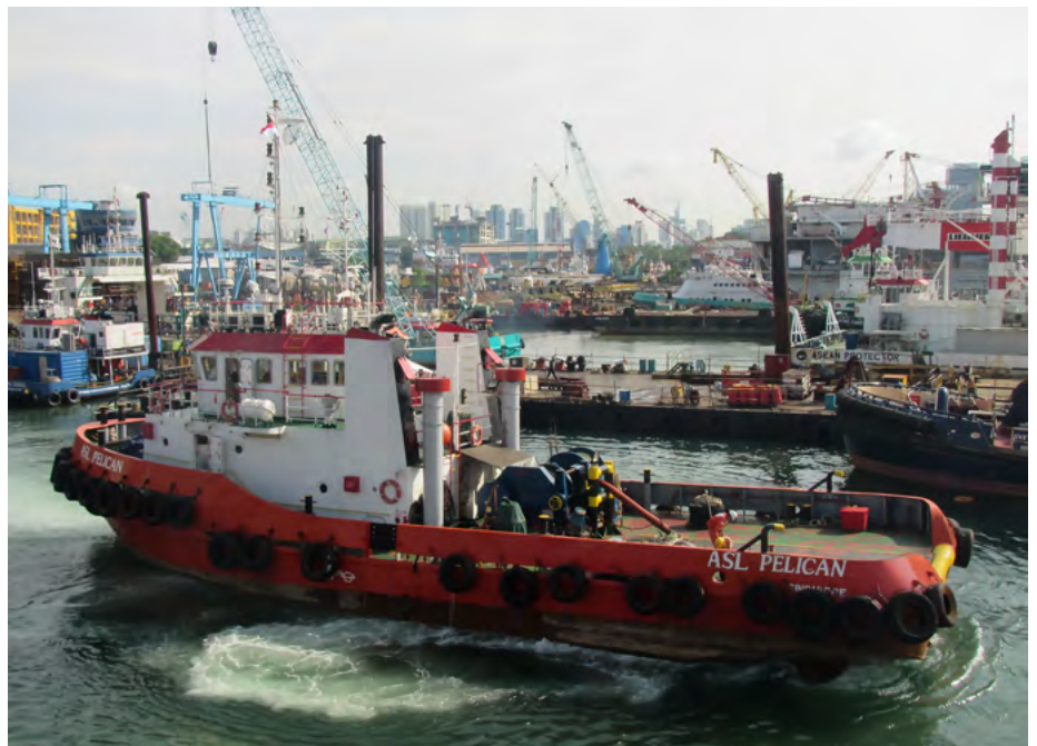
ASL PELICAN Singapore