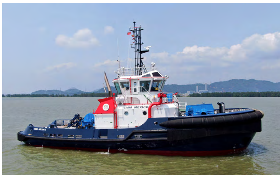
CMM MEXICO Mexico