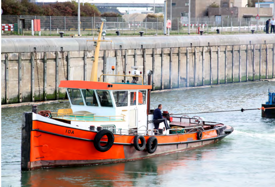
IDA III The Netherlands

AHTS Normand Titan , ex Rem Balder (2007 – 9371385) owned by Rem Marine Shipping AS, operated by Solstad Shipping AS has